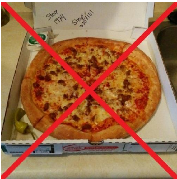
Incorrect angle (camera should be directly above the pizza).