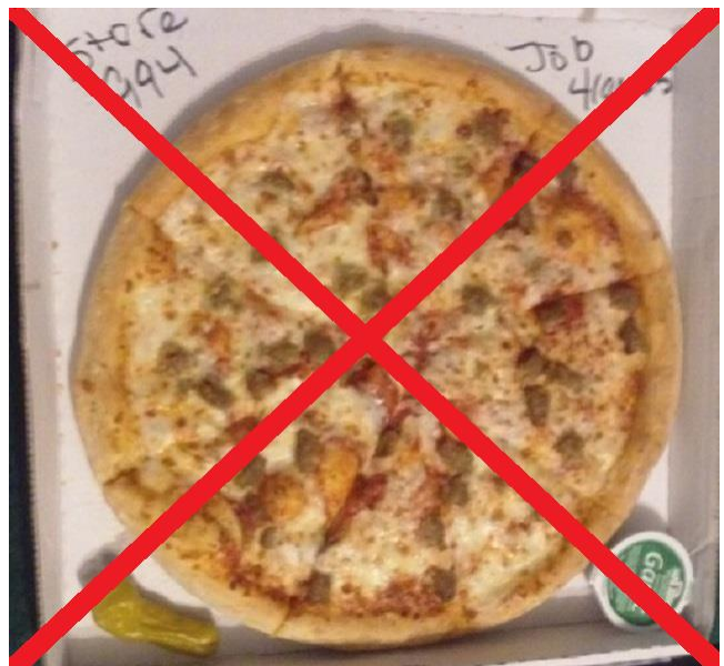
Too pixelated and unclear