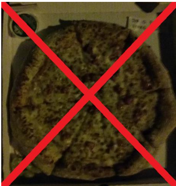
Too dark and unclear