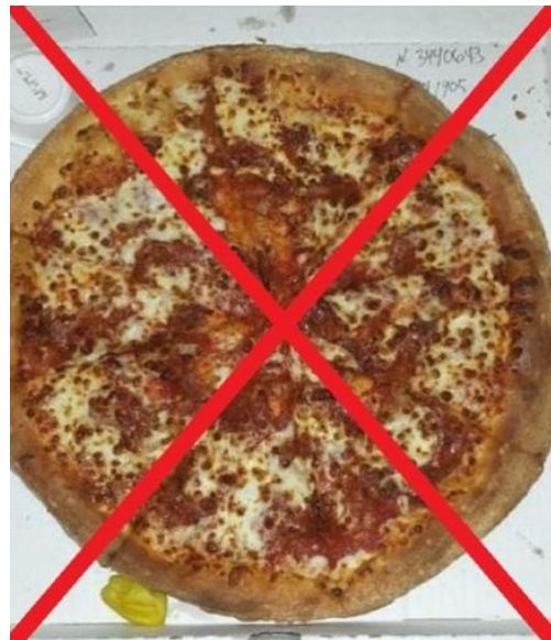
Two sides of the pizza are excluded from the photo.